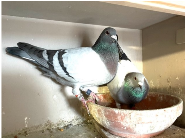
2 nd Open with his hen 30 minutes after arriving home