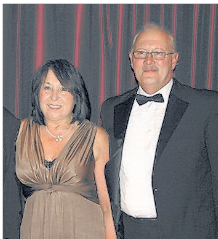
R. Lutner & Co.